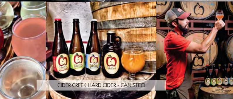
CIDER CREEK HARD CIDER - CANISTEO