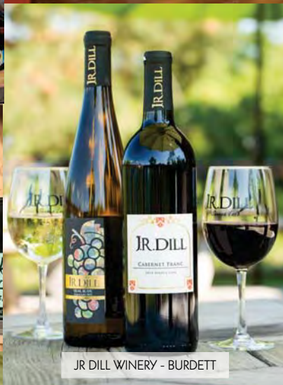
JR DILL WINERY - BURDETT