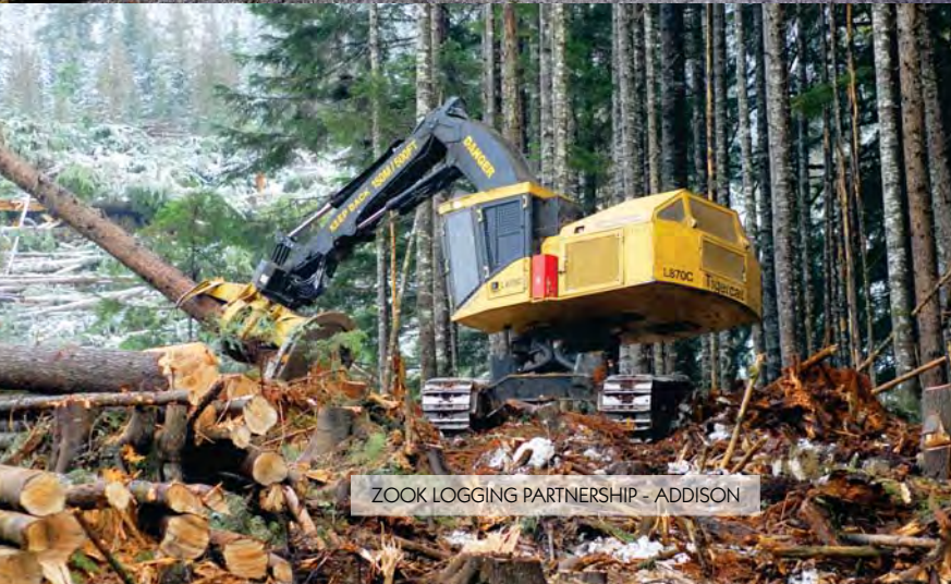
ZOOK LOGGING PARTNERSHIP - ADDISON