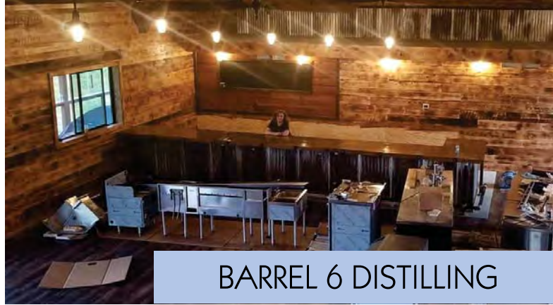
BARREL 6 DISTILLING

This past fall, REDEC teamed with the Small Business Development Center and the Steuben County IDA to support two separate business ventures that together meet a common goal.