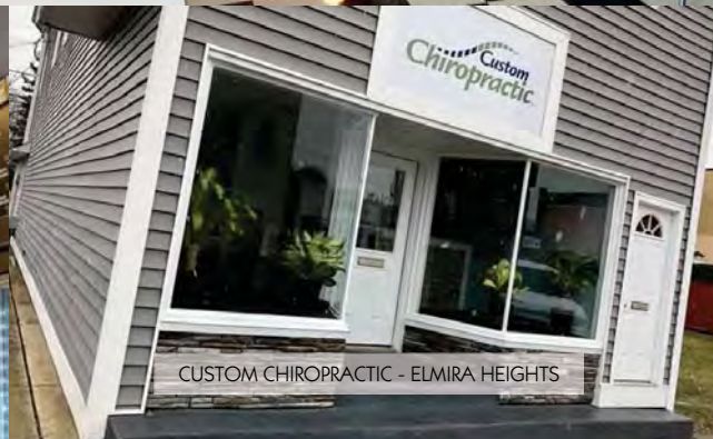
CUSTOM CHIROPRACTIC - ELMIRA HEIGHTS