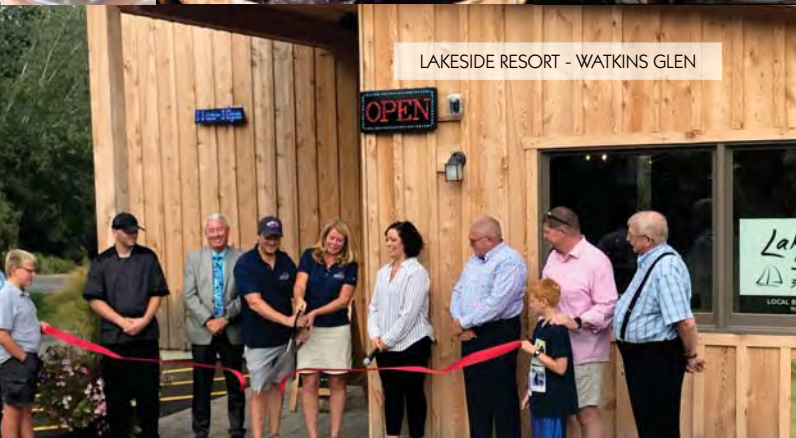
LAKESIDE RESORT - WATKINS GLEN