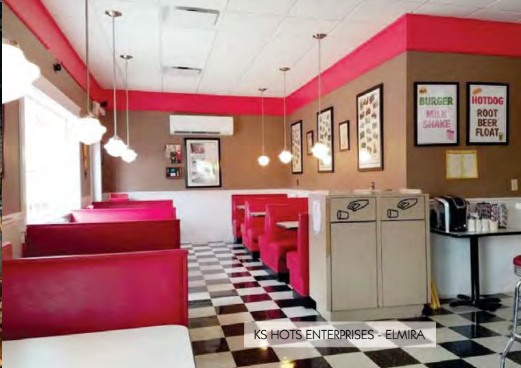
KS HOTS ENTERPRISES - ELMIRA