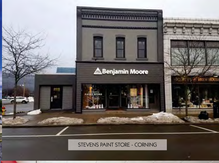
STEVENS PAINT STORE - CORNING