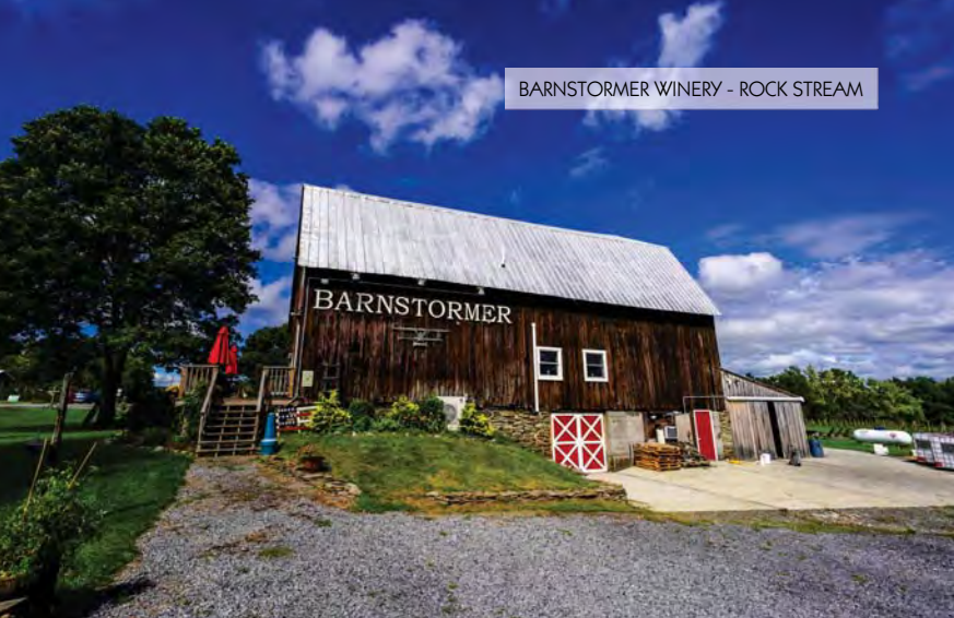
BARNSTORMER WINERY - ROCK STREAM