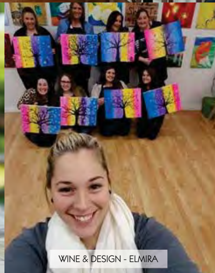
WINE & DESIGN - ELMIRA