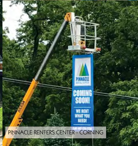
PINNACLE RENTERS CENTER - CORNING