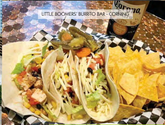
LITTLE BOOMERS' BURRITO BAR - CORNING