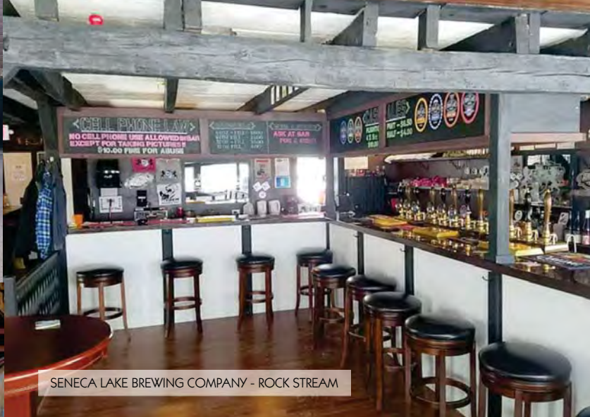
SENECA LAKE BREWING COMPANY - ROCK STREAM