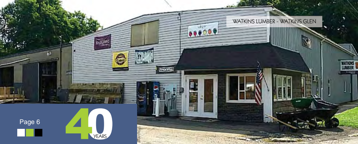
WATKINS LUMBER - WATKINS GLEN