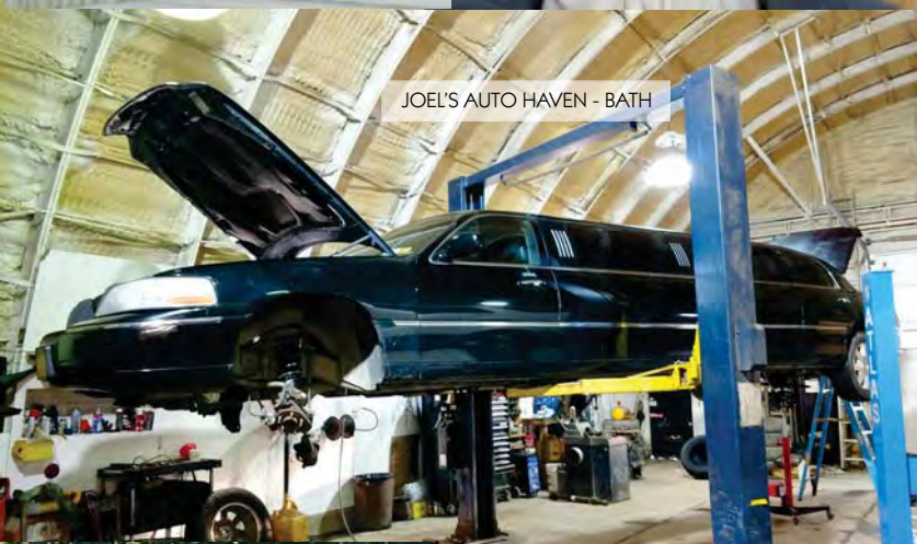
JOEL'S AUTO HAVEN - BATH