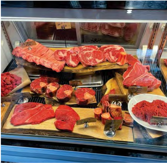
THE BUTCHER'S SON