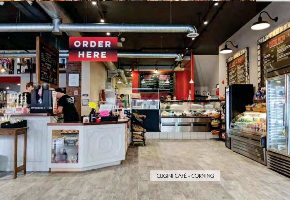
CUGINI CAFÉ - CORNING