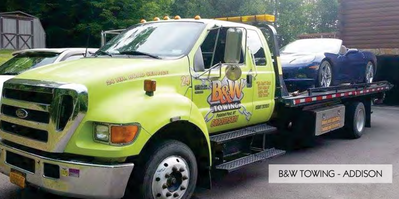
B&W TOWING - ADDISON