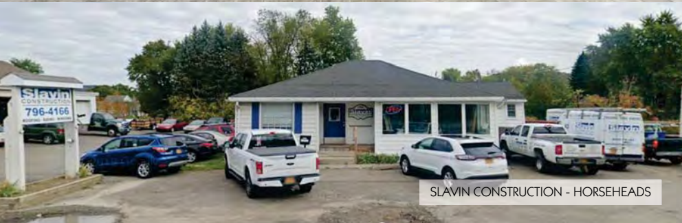
SLAVIN CONSTRUCTION - HORSEHEADS